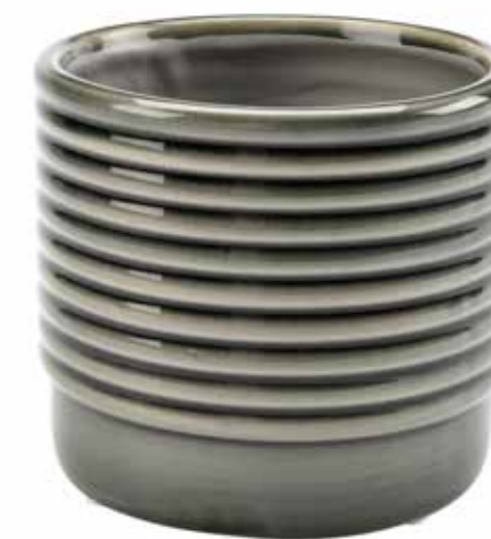
Grey - Small GIG/OSLOGREYSM Diameter 14cm, height 14cm Case Qty: 2