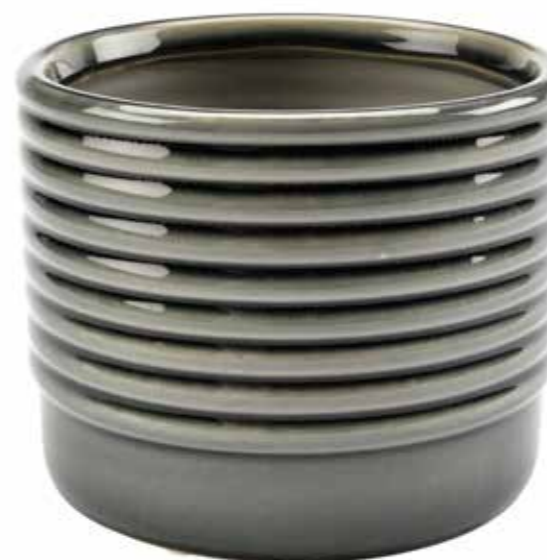
Grey - Large GIG/OSLOGREYLG Diameter 17cm, height 17cm Case Qty: 2