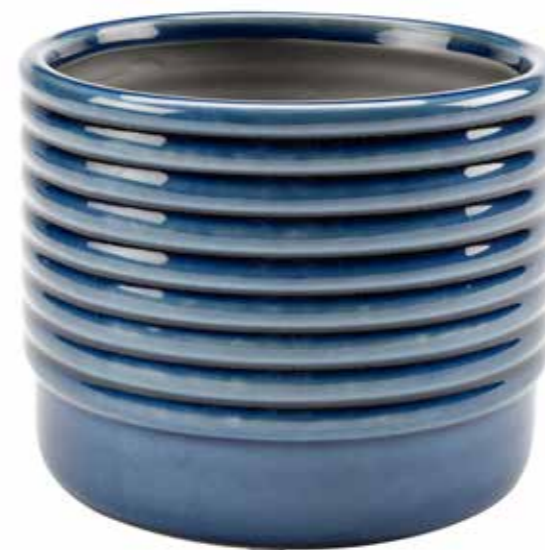
Blue - Large GIG/OSLOBLUELG Diameter 17cm, height 17cm Case Qty: 2

Oslo This very tactile design has a ribbed finish to the upper part of the pot, catching the glaze in bands of deep colour for a unique look. Available in grey for the ever-popular neutral palette, and a deep blue, a key accent colour for 2020/21 and Pantone Colour of the Year.