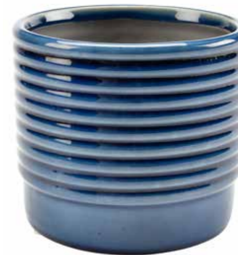
Blue - Small GIG/OSLOBLUESM Diameter 14cm, height 14cm Case Qty: 2