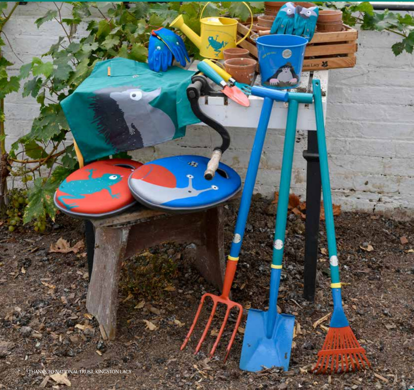
THANKS TO NATIONAL TRUST, KINGSTON LACY