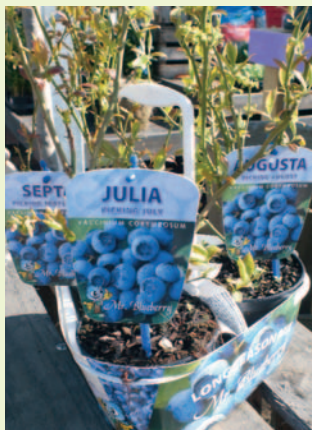
Mr Blueberry has entered the Veg-2-Gro chart for the first time with its Tri-Pack and gone straight to No. 1.

To read the full chart information this week go to