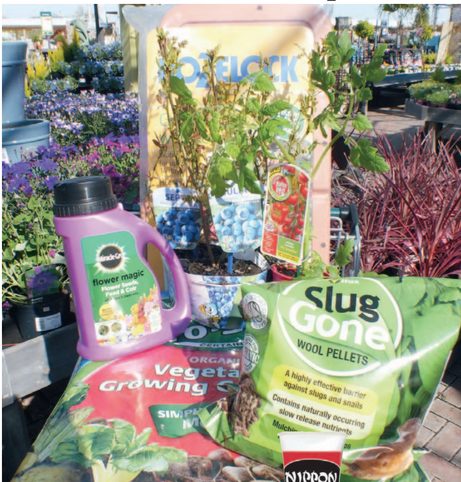
Your GTN Bestsellers New Products shopping basket of the week.